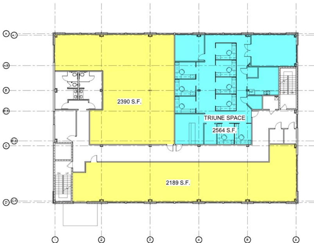
2ND FLOOR PLAN (NOT TO SCALE)