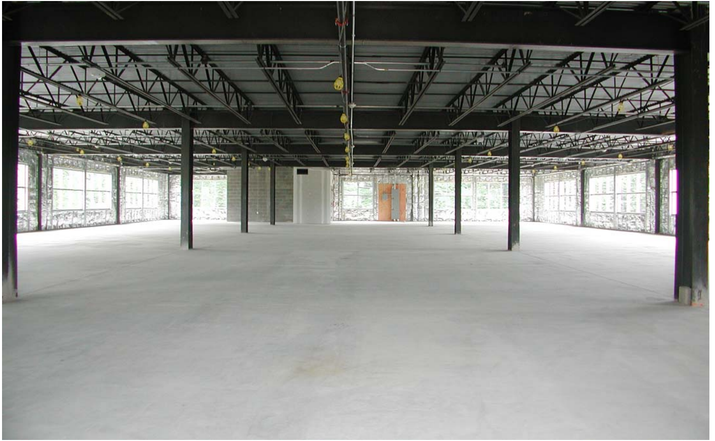
2ND FLOOR (4,579 SQ. FT. AVAILABLE)