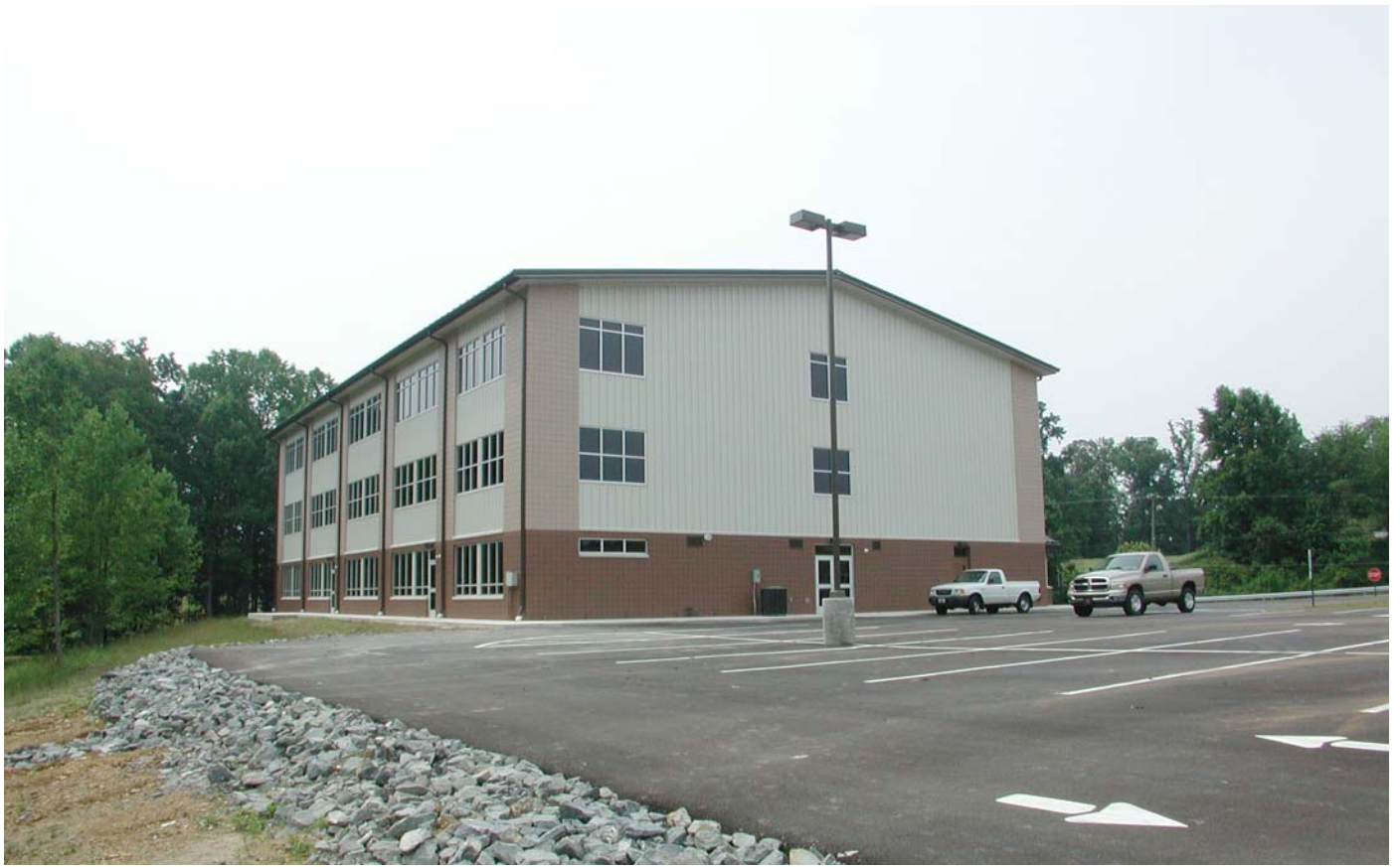
REAR OF BUILDING SHOWING PARKING LOT