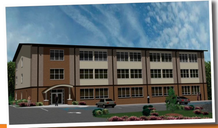
Braxton Technology Center